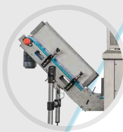
Infeed and tilting Operator panel