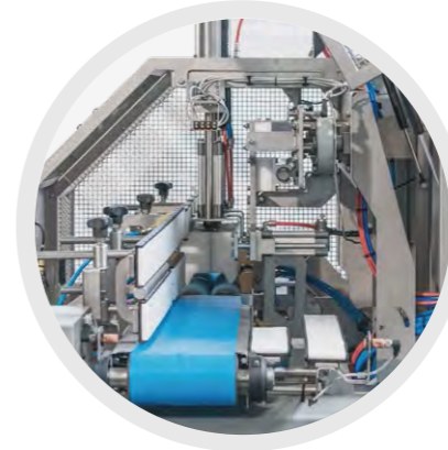
Infeed and tilting