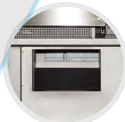
Rear film ejection