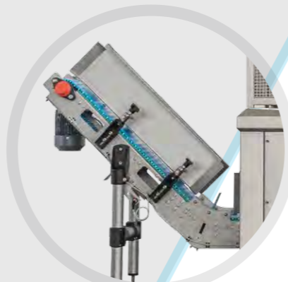
Outlet conveyor belt